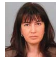
Maya Hristova Deputy Minister of Energy, Economy and Tourism of Bugaria