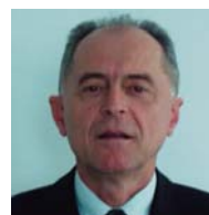
Vladimir Djurovic Plinacro